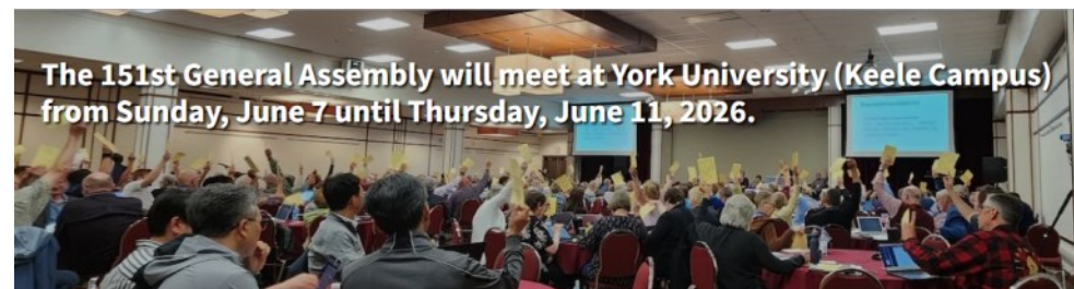
The 151st General Assembly will meet at York University (Keele Campus) from Sunday, June 7 until Thursday, June 11, 2026.

The General Assembly of the Presbyterian Church in Canada opens today and will be meeting all week. Please keep the Moderator and the commissioners in your prayers as seek God's wisdom and deal with the business that properly comes before them.