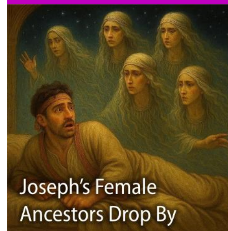
Joseph's Female Ancestors Drop By

St. Andrew's Hespeler Presbyterian Church 73 Queen Street East, Cambridge, ON N3C 2A9 519-658-2652