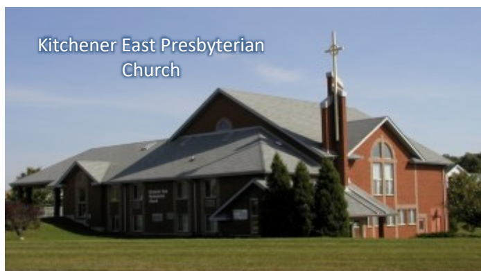
Kitchener East Presbyterian Church

But I believe it is time for us to realize what Donne saw centuries ago – that no congregation is an island. Every congregation is a part of the ministry that Christ has given to all of us. And any diminishment in that ministry is a diminishment to us all. When we hear the bell toll, we don't need to ask. Whoever it is tolling for, it is for us.