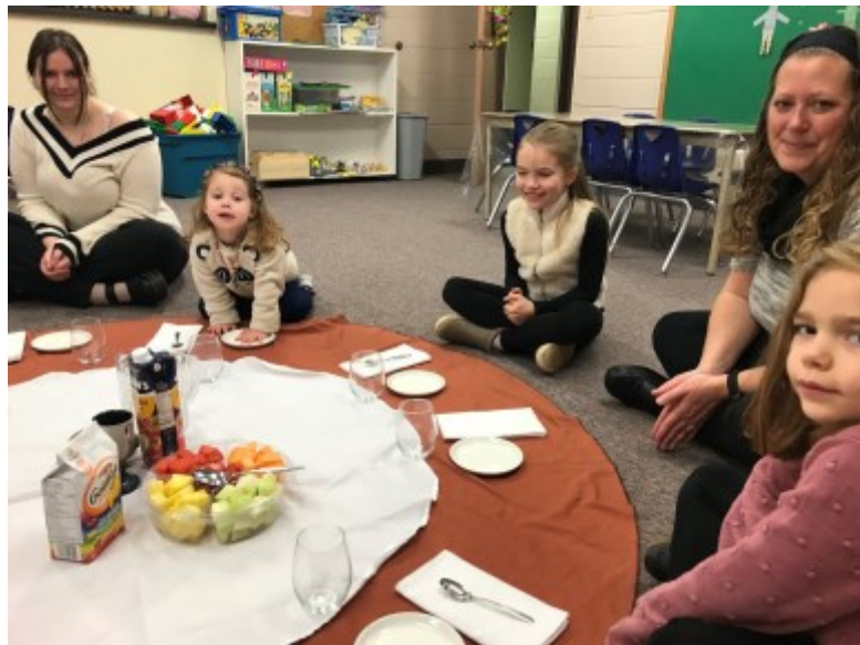
The Great Feast