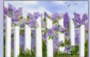
Sat April 21 Lilacs on the Fence

Sign up for 1 workshop or sign up for all!