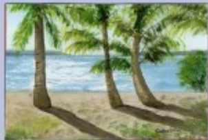
Sat April 20 Island in the Sun

Take part in this year's Spring Fling at St Andrew's Hespeler Presbyterian Church.