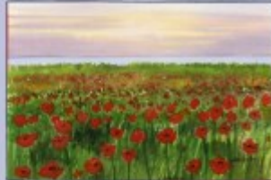
Sat April 13 Poppies by the Sea