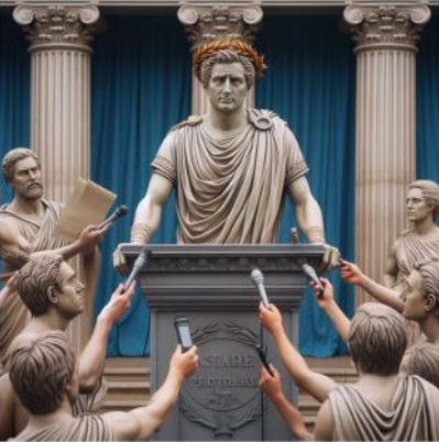
My Client didn’t say it! And if he did say it, it doesn’t mean what you think it means.

The Women in the Bible Study will continue this Wednesday, February 28. We will be looking at the story of Reuben and the Mandrake Machinations! We meet in the foyer. Coffee/tea will be served