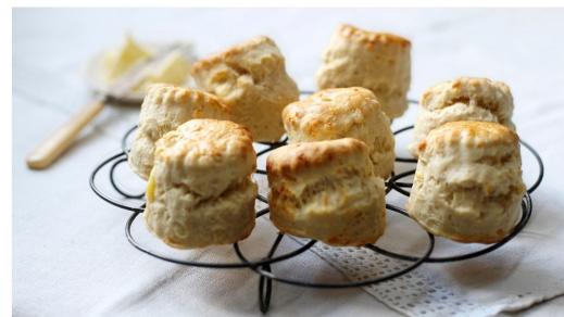
Award winning batch of scones

While we wait for the Dream Auction please think about how you might contribute. Do you have a talent or service that you could share? Do you knit, sew, create?