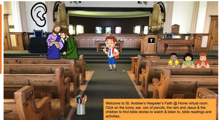
Welcome to St. Andrew's Hespeler's Faith @ Home virtual room. Click on the icons; ear, can of pencils, the ram and Jesus & the children to find bible stories to watch & listen to, bible readings and activities.

May/June "Today" daily devotional booklets have arrived. Some have been places in the mailbox at the church.