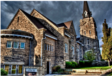
St. Andrew's is situated in the heart of the