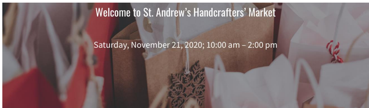
Handcrafters' Market Information

Stay tuned next week for more information including how to set yourself up as a bidder.