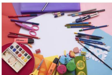
The list of vendors will be updated