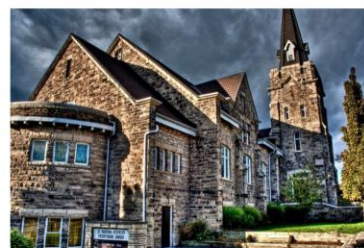
St. Andrew's is situated in the heart of the