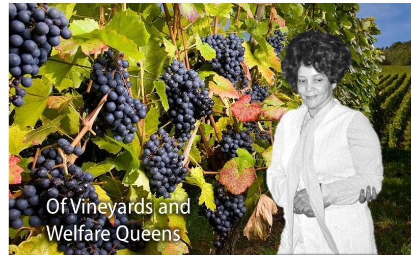
Of Vineyards and Welfare Queens

St. Andrew's Hespeler Presbyterian Church 73 Queen Street East, Cambridge, ON N3C 2A9 519-658-2652