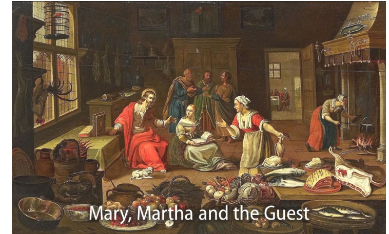
Mary, Martha and the Guest

St. Andrew's Hespeler Presbyterian Church 73 Queen Street East, Cambridge, ON N3C 2A9 519-658-2652