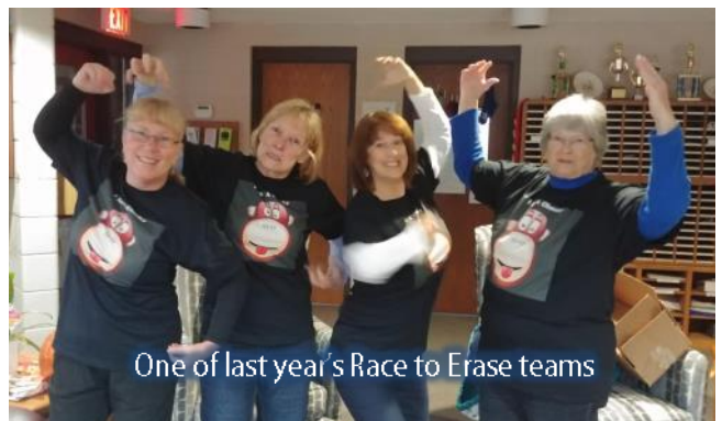
One of last year's Race to Erase teams